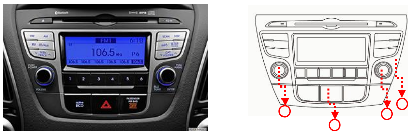
Fig11. Priority of applied texture on car console